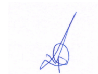
Executive Engineer Electrical Division-II, EM Sector, KMDA.